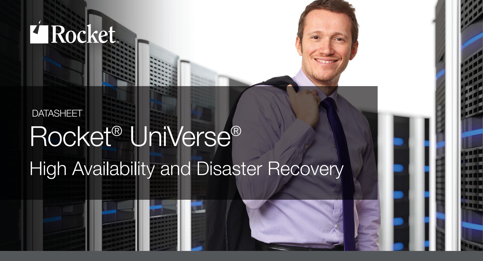
Reliable, Scalable, Resilient and Simplified Protection for Data and Applications